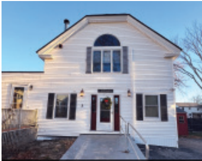
CARRIAGE HOUSE UNIT 3 ENTRANCE