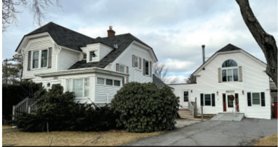
MAIN BUILDING AND CARRIAGE HOUSE