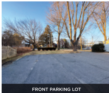
FRONT PARKING LOT