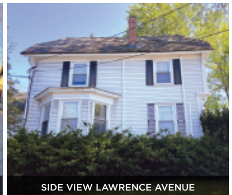
SIDE VIEW LAWRENCE AVENUE