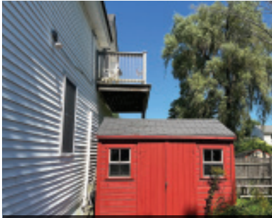
CARRIAGE HOUSE SIDE VIEW