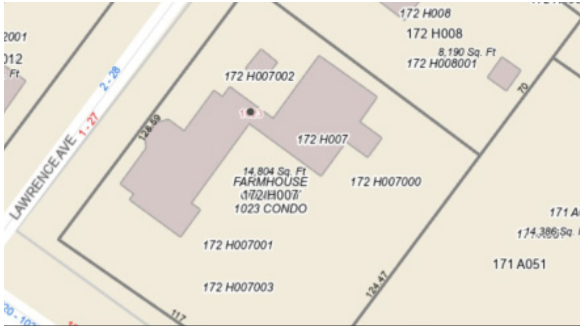
CITY OF PORTLAND TAX ASSESSORS MAP