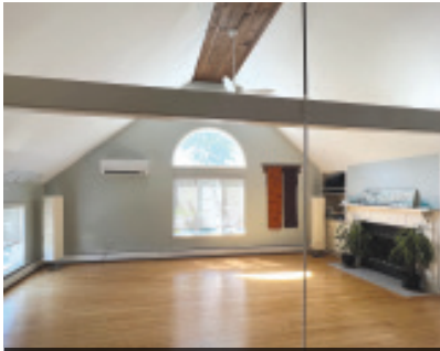
CARRIAGE HOUSE 2ND FLOOR